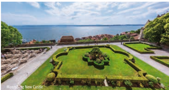
Meersburg New Castle